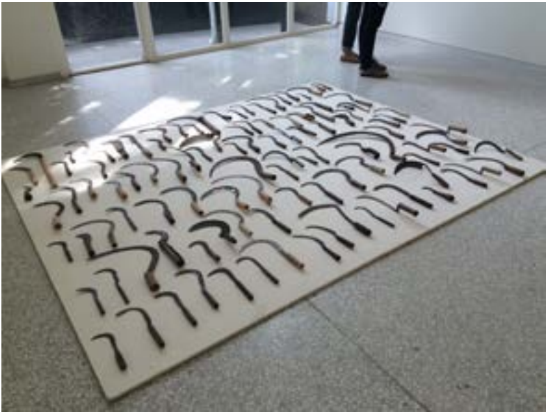
Figure 3. herman de vries, sickles from to be all ways to be , Venice Biennale, 2015. Courtesy of the artist.

Armpit presents an exclusively male world and yet even masculinity is laid bare as a subject formation in its obsolescence. The garage men combine a historical form of artisanship, with an equally long history of manual labor to make a new formation — a tinkerer who appropriates architectural structures in their demise and uses them for nonproductive labor. The wood fragments that make the scaffolding of the pavilion hark on the Latvian woodshed, and thereby suture the figure of the garageman with the tradition of artistic training in Latvia by which students would take over woodsheds as studios to train in plein air painting. Thus, the woodshed space sutures together the men's nonproductive manual work and the aesthetic sensibility for archaic spaces and tool-working.