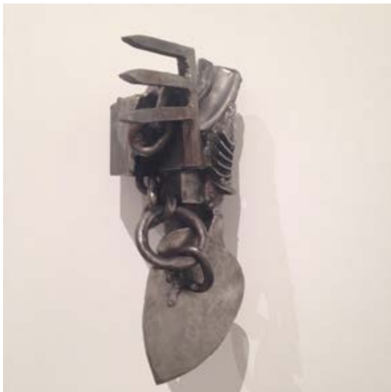
Figure 5. Melvin Edwards, Texas Tale , 1992. Courtesy of the artist.

Monica Bonvicini likewise created two sculptural amalgams for her Latent Combustion (2015) (Figure 6). Here, a grouping of chainsaws and leather straps were cast in concrete and covered in black liquid rubber, and then hung by chains from the ceiling. Though the chainsaws are perhaps among the most threatening and distinctly masculine of tools, nevertheless, the layout suggests an erotic overlay inspired as it is by the mise-en-scène of S&M sex clubs, so that the suspended grouping of tools is yielded to a libidinally charged probing of the objects' potential energies, rather than their direct deployment in the context of capitalist production or exploitation. The title of the