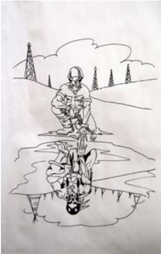
Figure 1. Anonymous, Indigenous Oil Worker (c.2008)

it? This idea of compensation is at the heart of such a decision, since the damages created by tar sands extraction are obvious to anyone who lives in their vicinity, and the remaining question is whether or not one might receive enough other benefits to still make the choice worthwhile.