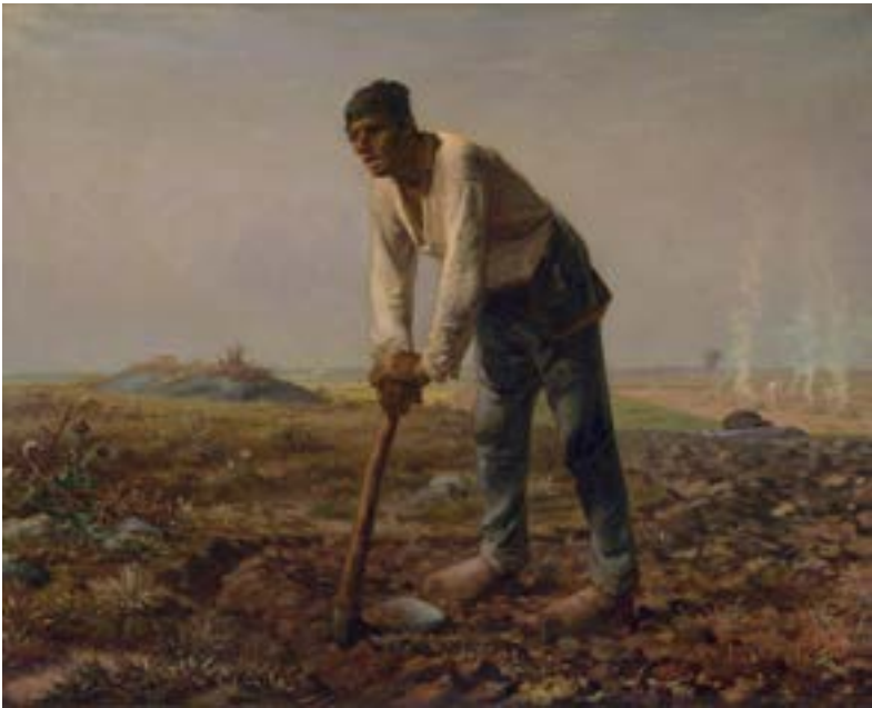
Figure 1. Jean-François Millet, Man with a Hoe , 1860 – 1862, Oil on canvas, 81.9 × 100.3 cm (32 1/4 × 39 1/2 in.). The J. Paul Getty Museum, Los Angeles.

revolutionizing or negatively as exploitative, and that these choices are energetically charged (positively by hope or negatively by anger), he locates the possibility of rearticulating the mechanisms of that system through precisely these political energies. That is to say, the seemingly magical process of deranging capital into interest-bearing capital can be undertaken as a representational procedure by which labor is inverted from its positive energies to its negative ones. A consciousness of the labor substructure thus occurs through the energetic derangement of representing capital. Moreover, such derangements of representation are ways of tracking shifts in forms and modes of political resistance, in addition to the technical composition of what we might term the fossil-fueled exploitation of