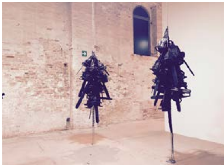
Figure 6. Monica Bonvicini, Latent Combustion , 2015. Courtesy of Studio Bonvicini.

that the modern drive forward and postmodern fragmentation were always already dialectical accomplices and that Benjamin leverages the dialectic into a radicalized state of irretrievable meaninglessness. If Hegel characterized the modern condition as an opposition between the prose of modernity (the linguistic mode of economy, bureaucracy, science, and philosophy) and the failure of romanticism (symbolism as the mind trapped inside itself, unable to exteriorize and realize itself as representation), he equally leveraged from this opposition the possibility of a modern imagination with a figurative faculty: a form of reason that is captive within the exteriority of representation, sealed up in exteriority, a “thing of reason.” From this, Rancière opposes two fantasies of reason: a “bad” one in which reason is simply anachronistic and anarchical, and a “good” one, in which reason is sealed in its prehistory, a lateness that is also an anticipation of interpretation, reading, deciphering. 21 Thus can we understand