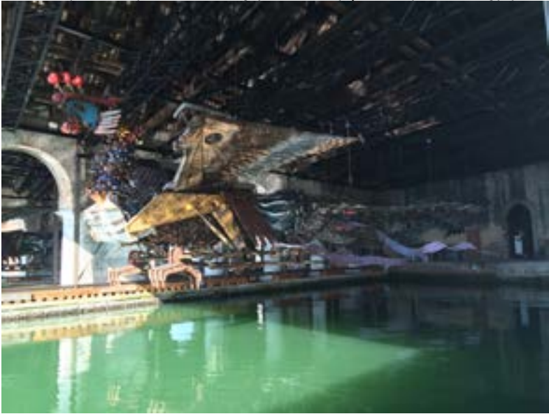
Figure 4. Xu Bing, Phoenix , 2015, construction site debris and materials, exhibited at the 56th Venice Biennale, Theme Exhibition, All World's Future, Venice, Italy, 2015.

is clear: the era of manual labor and its energies has been buried and encrypted in the bedrock of the earth itself, a tactic of containment in the era of finance capital. Yet, the remnants of labor return as petro-objects, artifacts of that buried labor. Moreover, it is not coincidental that the tools of labor qua archaeological object appears in an age when extractive technologies provide the global economy's most lucrative resources (fracking for oil and natural gas as well as mining). The staging of an excavation of the remnants of another era of labor signals the rendering inert of labor and its burial as the wasted remains of modernity. Moreover, these excavations make apparent the containment of labor as potential energy. (I would go so far as to describe labor power as a petro-fuel in its own right.) In this sense, the return of manual tools as art encompasses the formation of the labor class in the global economy as both an archaic energy source, and one