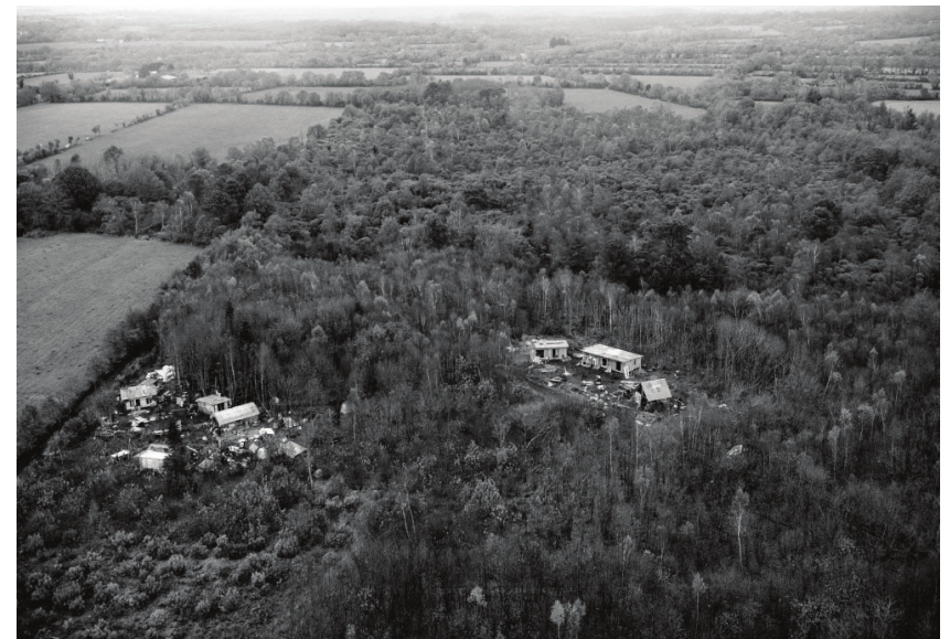
Squats in Rohanne forest