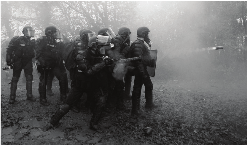
Mobile gendarmes attack opponents in the forest, 23 November 2012

So, from time to time it’s worthwhile to say it again: we are in the process of winning, and on the other side they must be pretty bothered! Besides, one only has to read their pitiful declarations, exhorting good citizens to let the politicians think in their place, desperately waving the red flag of the ultra-left/anarcho-autonomous/whatever-frightens menace, trying again and always to divide opponents with calls to reason, coloring themselves regularly