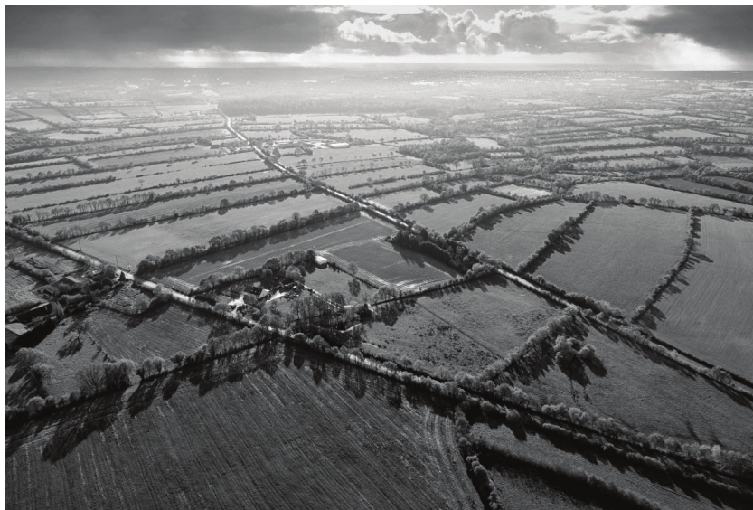
An aerial view of the ZAD