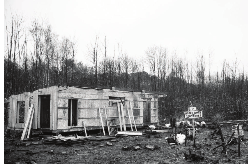
A building under construction by Rohanne forest, 18 November 2012

Over here the struggle continues in the days to come: this weekend and next week to continue the reconstruction on the land occupied today, in Rohanne forest and elsewhere; next weekend for the monthly demonstration against the airport and its world in Nantes Saturday the 24th; and in the months to come to prevent the destruction of Rohanne forest and the first works on the roadblock planned in the months to come – rendezvous details will be transmitted on the website zad.nadir.org .