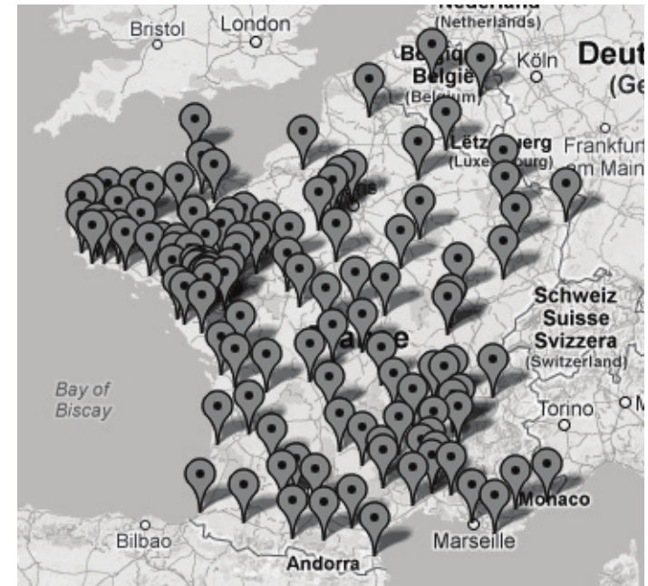
A map of ZAD support committees across France