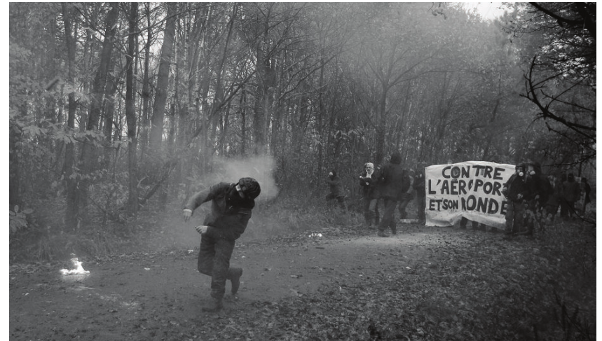
A zadiste throws back a police tear gas canister, 23 November 2012